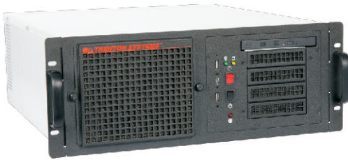
Trenton TVC4403 Video Controller Shown with a single processor SBC and backplane