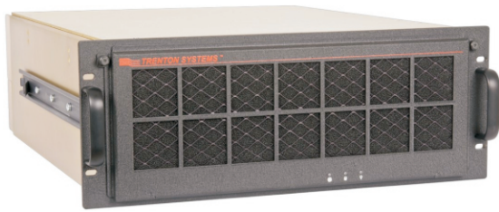
Trenton TMS4705 Military Computer Shown with a dual-processor embedded motherboard