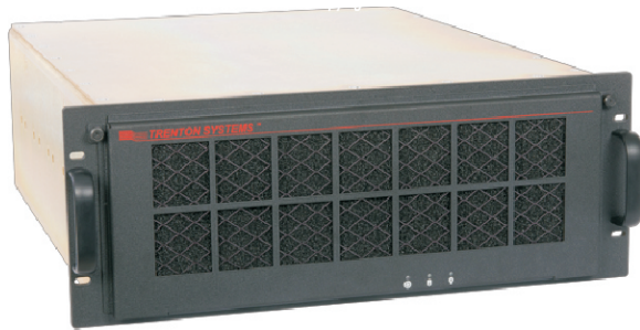
Trenton TMS4704 Military Computer Shown with a dual-processor embedded motherboard