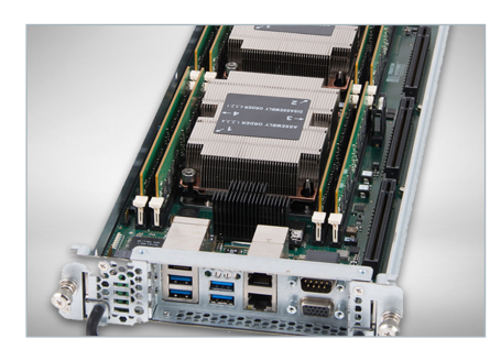
Xeon or Core Series CPUs Enhance system performance with single Core<sup>™</sup> or dual Intel<sup>®</sup> Xeon<sup>®</sup> Processors.