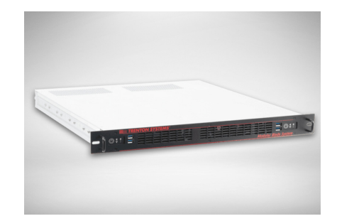
Reduced MTTR Replace modular blades and power supply in seconds. Customizable and flexible architecture for lower TCO.