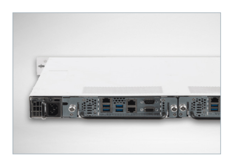
1200W Removable PSU Ample wattage in a low-profile power supply that easily supports both processor boards.